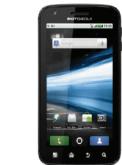
MOTOROLA ATRIX™ 4G (MB860)