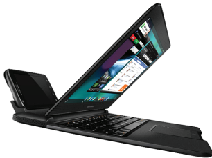
Motorola Laptop Dock